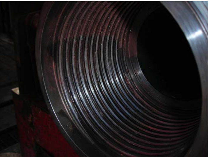
3 rd Gen DSC post-run inspection